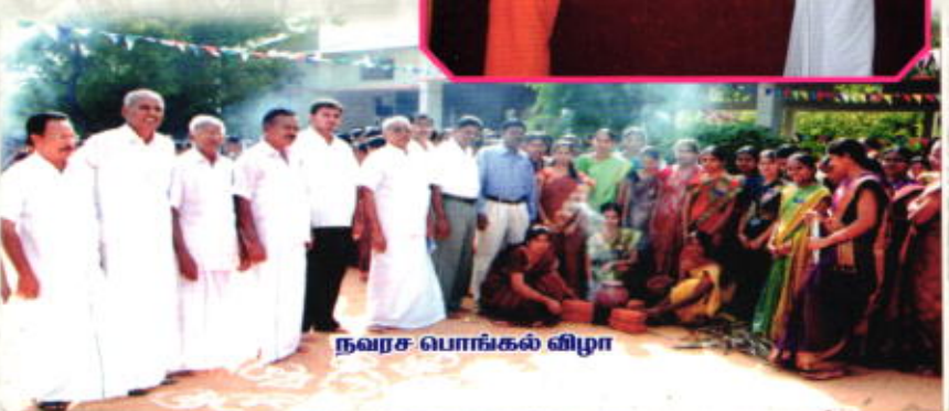
நவரச பொங்கல் விழா