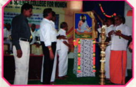
உலகத் திருக்குறள் பேரவை தொடக்க விழா