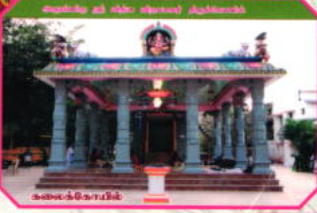
கல்விக்கோயிலுக்குள் ஸ்ரீ வித்ய விநாயகரின் கலைக்கோயில்