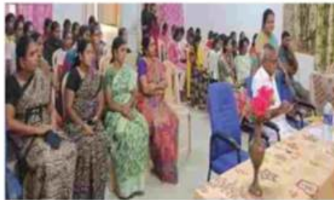
08.11.2023 DC Meeting