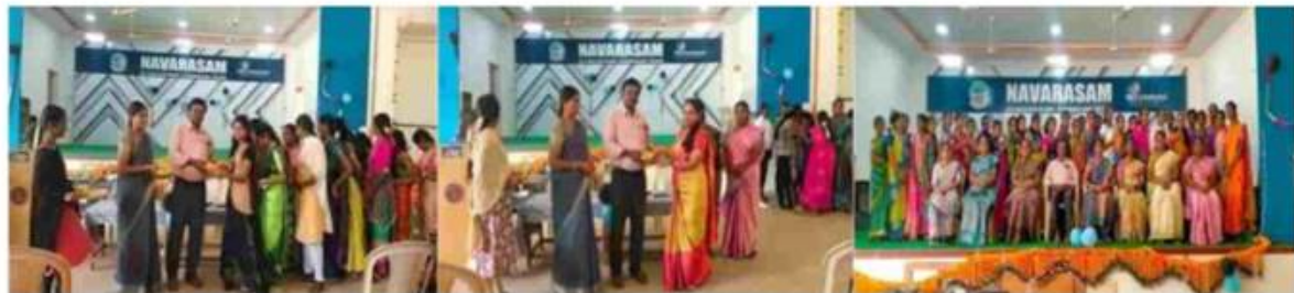
On 23.08.2023 Students participated in one day workshop at Bharathidasan College, Ellispet. Onam was celebrated on 29.08.2023, at College Auditorium.