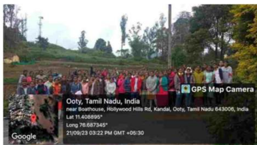
Black thunder trip at BLACK THUNDER at Mettupalayam, Ooty on 22.09.2023