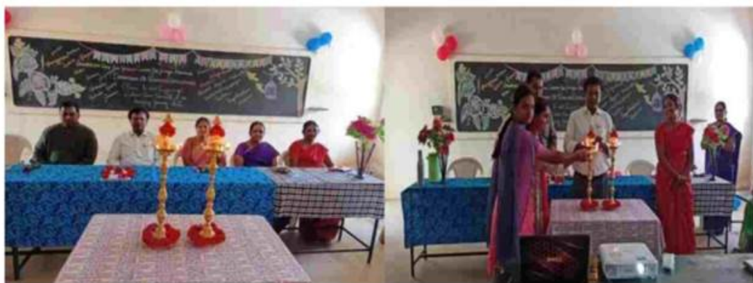
On 05.09.2023 Teacher's day celebration in our Department