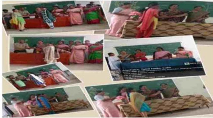
Virtual Orientation programme-“Capital market awareness for young investors” held on 19.9.2023