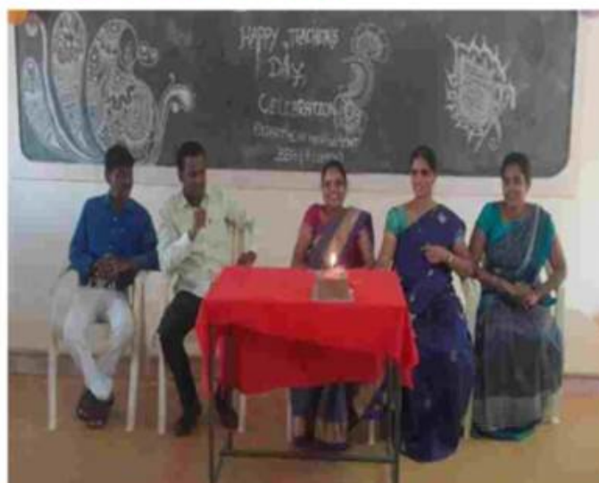
Teacher's day celebration on September 5 th , 2023.